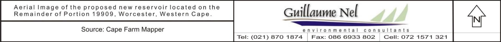
Figure 1: Aerial Image of the proposed reservoir development site.